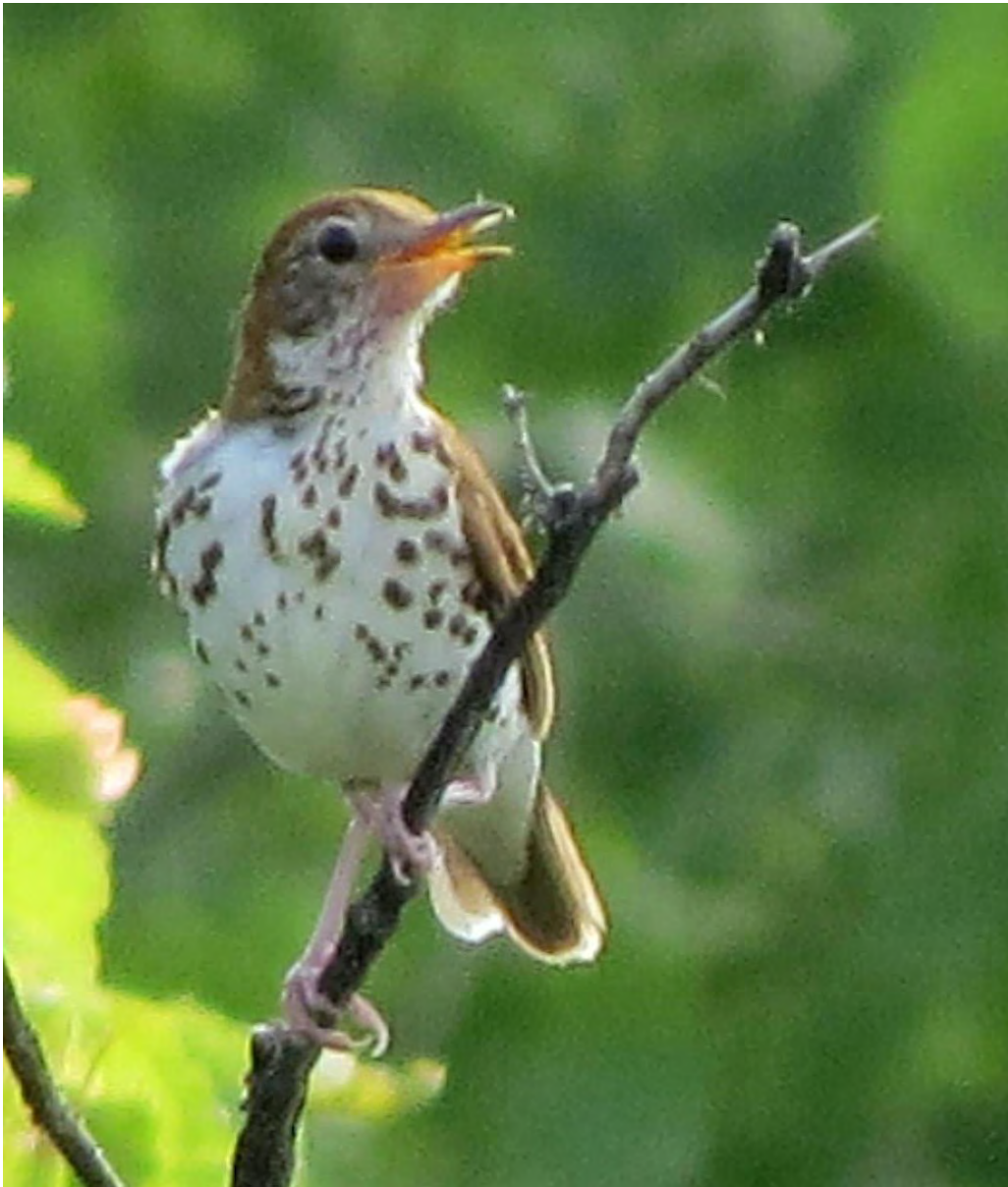
Wood Thrush, near Cedar Crest, Sandia Mountains, 6 June 2015.