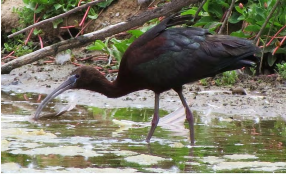
Adult Glossy Ibis, Albuquerque, 9 June 2015.