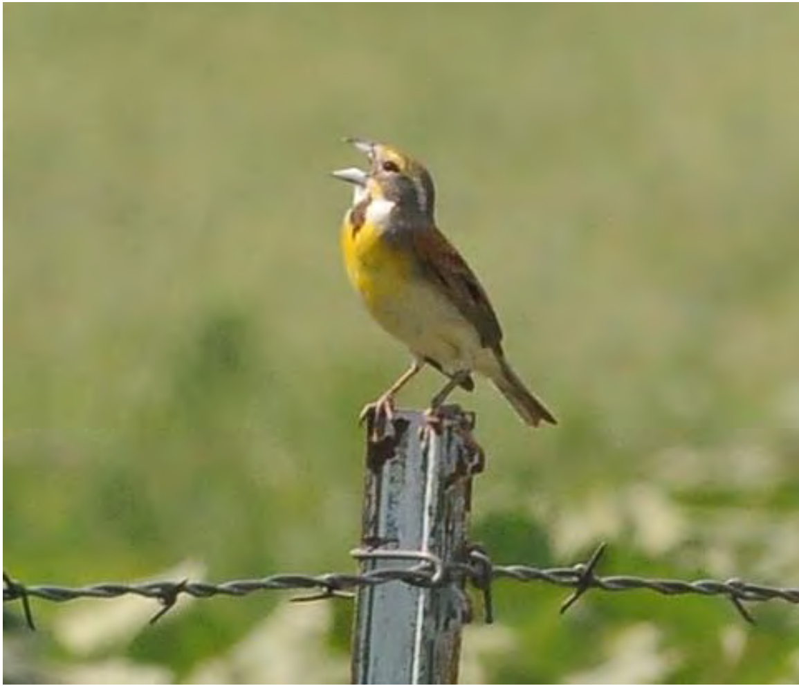
Dickcissel, near Miami, Colfax County, 21 June 2015.