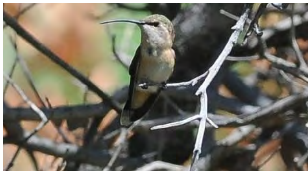
Female Lucifer Hummingbird, Cottonwood Canyon, Peloncillo Mountains, 25 July 2015.

Lucifer Hummingbird —An ad. ♀ was in upper Cottonwood Canyon, Peloncillo Mts. 25 Jul (NEH**, WTE*). High count at P.O. Canyon was 17 ♂♂ and 7 ♀♀ on 6 Jun (CDL); the first hatch-year ♂ was there 7 Jul (CDL).