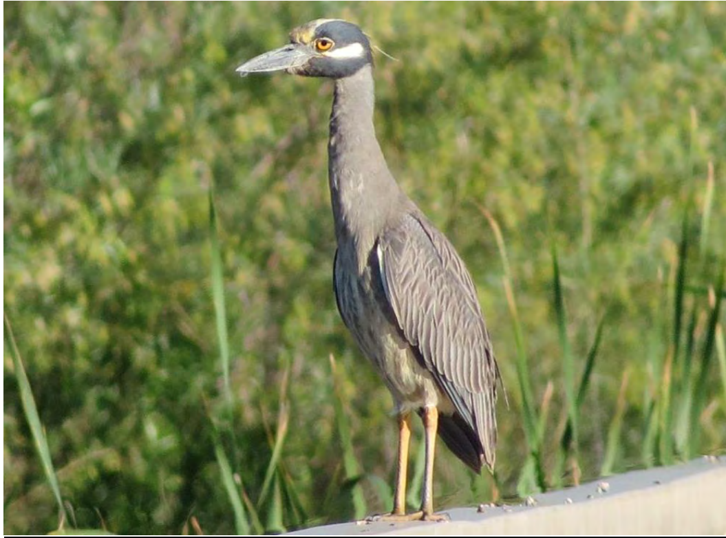
Subadult Yellow-crowned Night-Heron, Bosque del Apache NWR, 2 June 2015.

Glossy Ibis —A late ad. was at RGNC 9 Jun (WEM**, DLH).