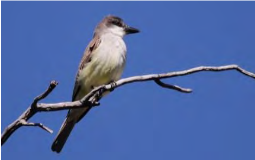
Thick-billed Kingbird, Tierra Blanca Creek, Black Range, Sierra County, 13 June 2015.

Eastern Kingbird —Maintaining an upper RGV presence, a pair was at the Ohkay Owingeh lakes 12 Jun (JEP) and one was at Española 8 Jun (WTE). Noteworthy for the prairie was one near Rosebud 4 Jun (CLH).