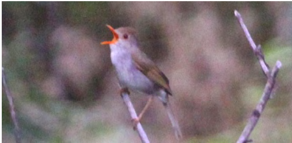
Orange-billed Nightingale-Thrush, Nutria Canyon, Zuni Mountains, McKinley County, 18 July 2015.

Townsend's Solitaire —Two, including a stub-tailed, spotted fledgling, were near Cloudcroft 12 Jul (CMR).