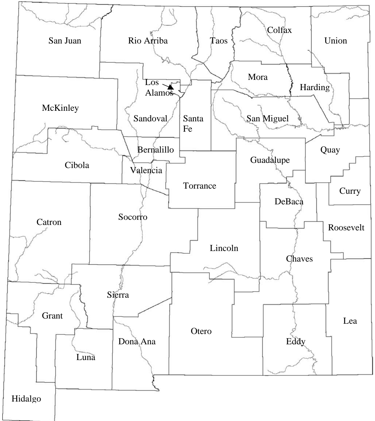
NEW MEXICO COUNTIES