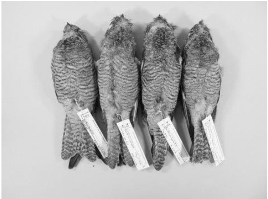
Figure 1: Dorsal and ventral views of 2 specimens each of Chordeiles minor howelli and C.m. henryi , showing about maximum degree of variation in each series.

Oberholser (1914) recorded the specimens from New Mexico as he identified them ( howelli p.63; henryi p. 60), but mapped their ranges as being disjunct. Selander (1954), chose to ignore the New Mexico specimens, possible because they did not fit his idea of allopatric subspecies distributions. Mosaic distribution resolves this problem.