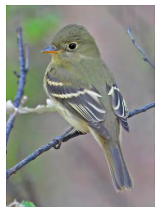
Yellow-bellied Flycatcher, Melrose Migrant Trap, September 9, 2011.

records, including Black-capped Vireo (Vireo atricapilla; 2004), Golden-crowned Warbler (Basileuterus culicivorus; 2004, see Howe and Parmeter 2004), and Green Kingfisher (Chloroceryle americana; 2007). It was Jerry who rediscovered the Sungrebe (Heliornis fulica) at Bosque del Apache National Wildlife Refuge on 18 November 2008, the day after word broke that it had been photographed on 13 November. His patience and skill as a photographer enabled him to obtain diagnostic series of photos of many difficult-to-identify species, such as Vaux's Swift (Chaetura vauxi) in Albuquerque and multiple Yellow-bellied Flycatchers (Empidonax flaviventris) on New Mexico's eastern plains. While his talents were deployed throughout New Mexico and elsewhere, Jerry had a special affinity for the Melrose Migrant Trap and he did more than any other individual to document records at that oasis and give it the prominence among birders that it enjoys today (see Parmeter 2007, 2013).