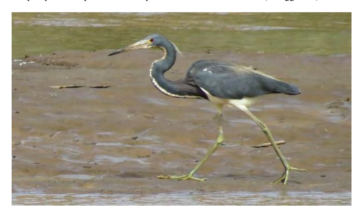
Tricolored Heron, Albuquerque, 16 July 2018.