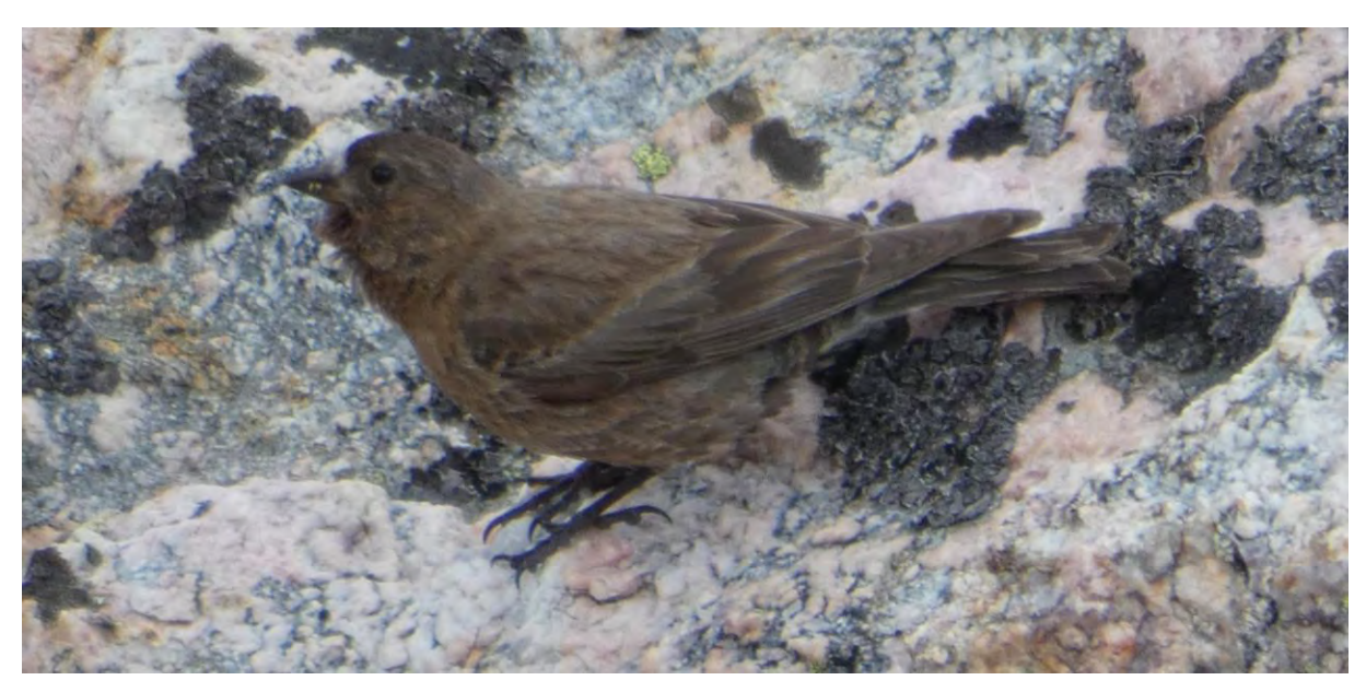
Volume 57, Number 3, Summer 2018