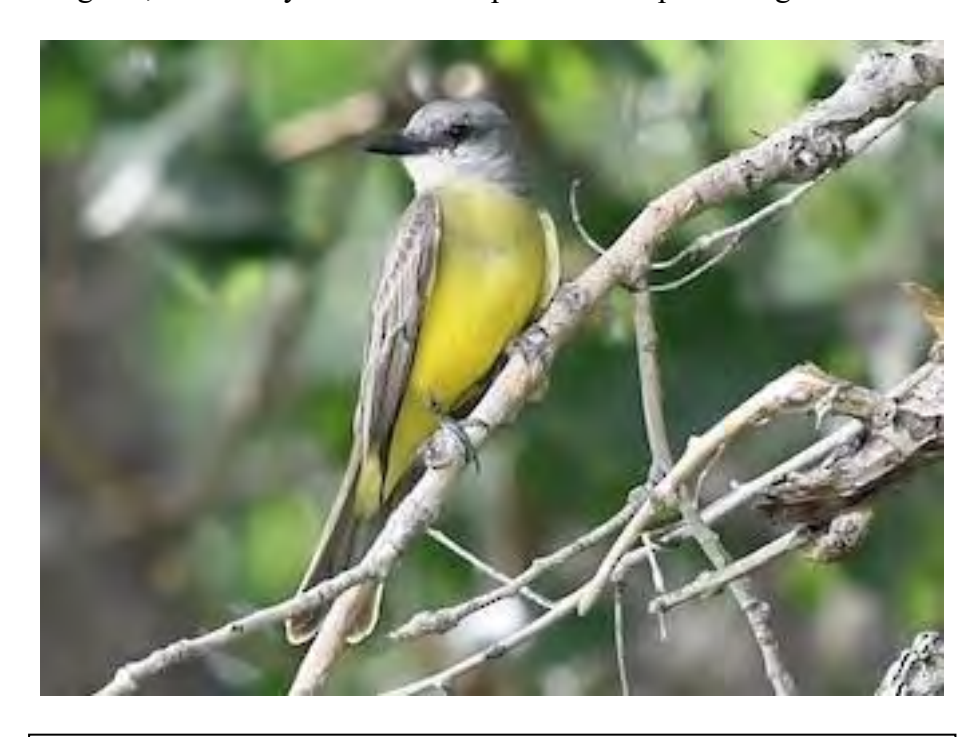
Tropical Kingbird, Rattlesnake Springs, Eddy Co., 10 June 2018.

<u>Tropical Kingbird</u>—Continuing from 27 May, one at Rattlesnake Springs was seen and heard by many through Jun to 22 Jul (RSN**audio, JEP*, m.ob., m.ph.); a second bird was present 1 & 7 Jul (RSN). This event constitutes only the second confirmed record of the species for the state; there are at least nine confirmed New Mexico records of Couch's Kingbird, the closely related sister species to Tropical Kingbird.