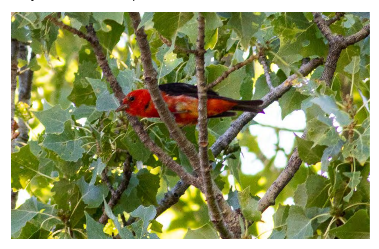
Male Scarlet Tanager, Las Animas Creek, Sierra Co., 17 July 2018.