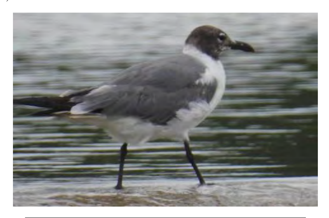
Laughing Gull, Lake Carlsbad, Eddy Co., 6 July 2018.

<u>Laughing Gull</u>—Continuing from 29 May, a first-cycle individual was at Brantley L. 1-2 Jun (DK**, NEH**). A 2<sup>nd</sup>-cycle individual was at L. Carlsbad 6-8 Jul (JEP*, RSN**, SW).