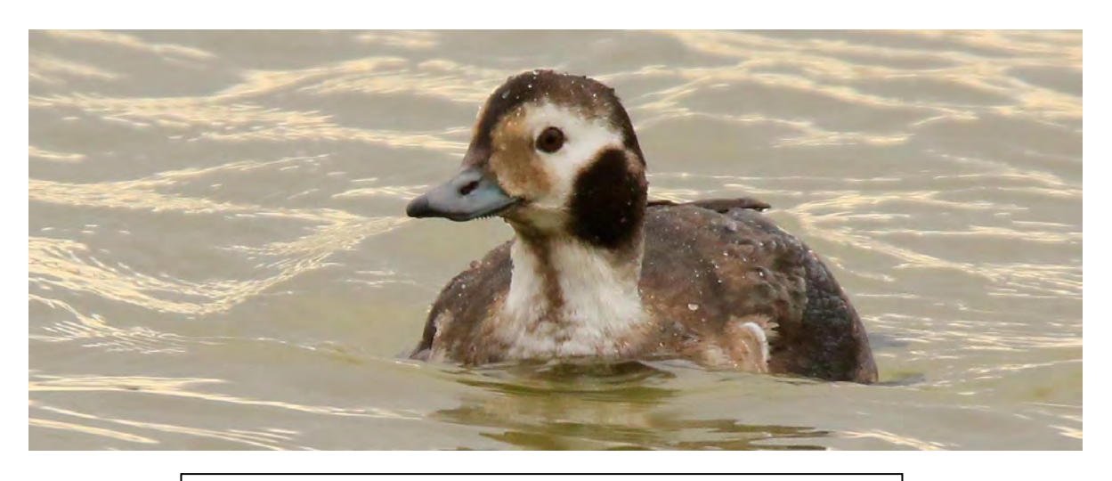
Long-tailed Duck, female, Bosque del Apache NWR, Socorro Co.. 29 December 2016.