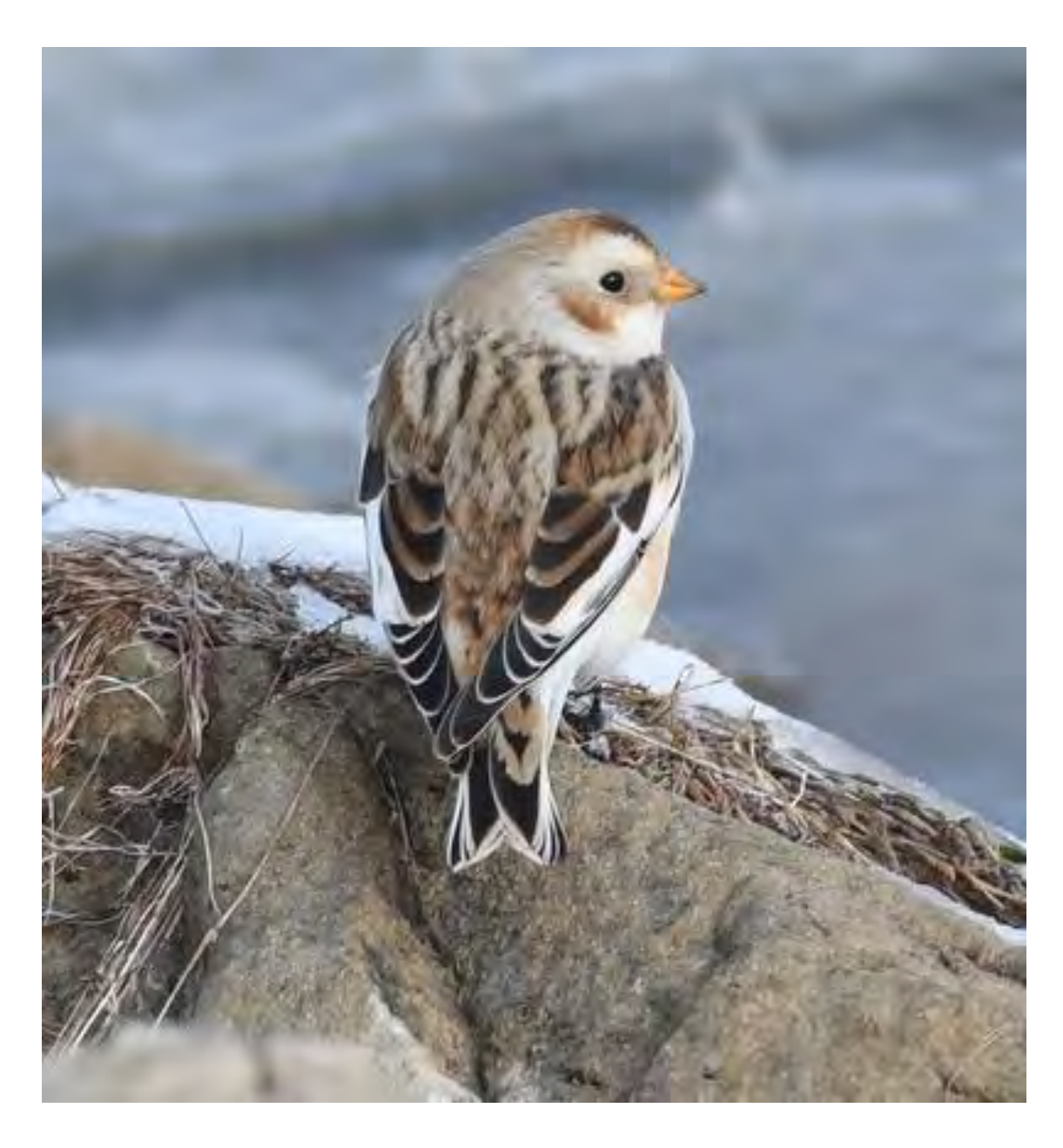
Volume 56, Number 1, Winter 2016 – 2017