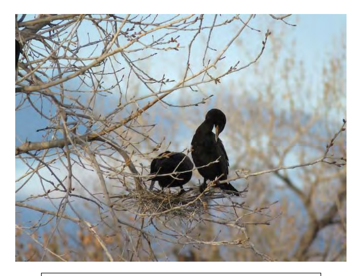
Neotropic Cormorant, pair nest-building, Tingley ponds, Albuquerque, Bernalillo Co., 19 February 2017.