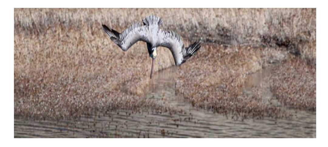
Brown Pelican, adult, plunge-diving, Elephant Butte Lake, Sierra Co., 8 January 2017.