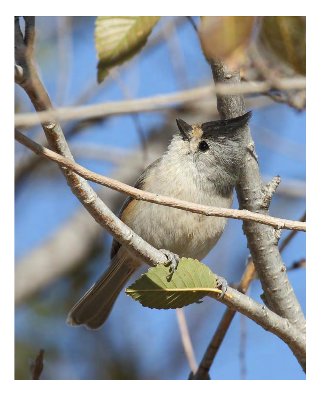
Volume 57, Number 1, Winter 2017 – 2018