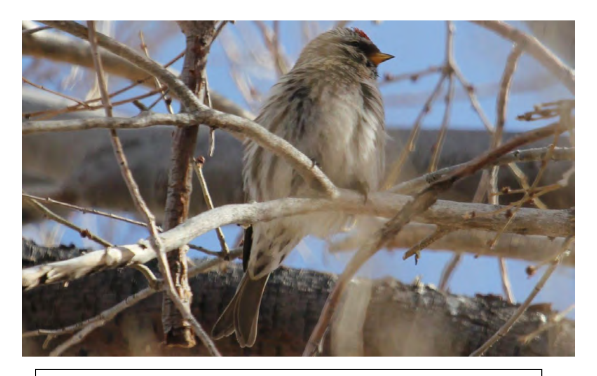
Common Redpoll, Clayton cemetery, Union Co., 19 January 2018.

<u>Common Redpoll</u>—One at the Clayton cemetery 19-20 Jan (MJB**, NDP**, JEP*) provided only the 6<sup>th</sup> credible state record.