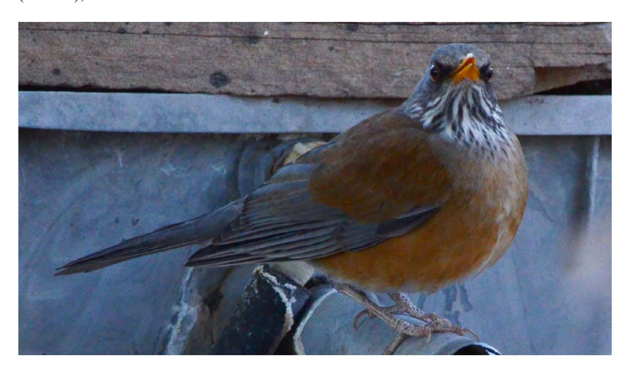
Rufous-backed Robin, La Union, Doña Ana Co., 22 January 2018.

<u>Rufous-backed Robin</u>—Nicely documented was one at La Union 22 Jan & 4 Feb (DAB**); it established the state's 20<sup>th</sup> overall record and the 7<sup>th</sup> since 2013.