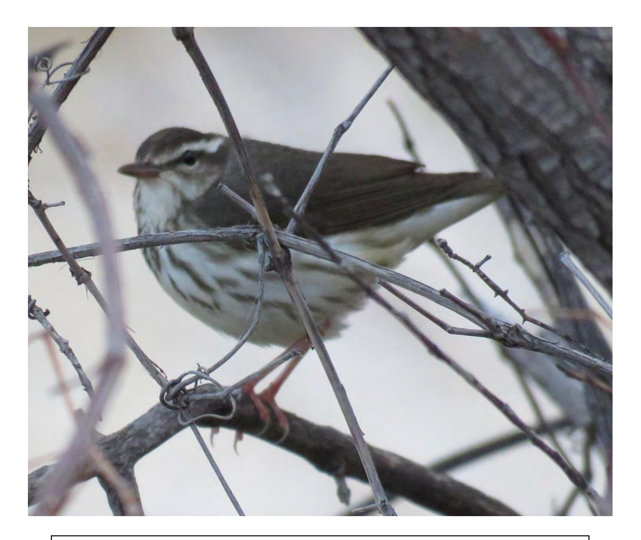
Louisiana Waterthrush, Oliver Lee State Park, Otero County, 4 February 2018.