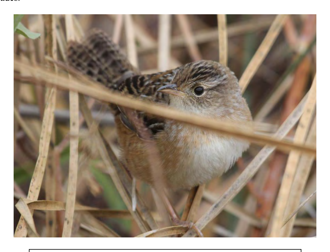
Sedge Wren at Blue Hole Cienega near Santa Rosa, 7 October 2012.

<u>Sedge Wren</u>—One at Blue Hole Cienega near Santa Rosa 7-15 Oct (NDP**, MJB**, JEP*, JRO**, m.ob.) was the first confirmed by photo or specimen in nearly two decades.