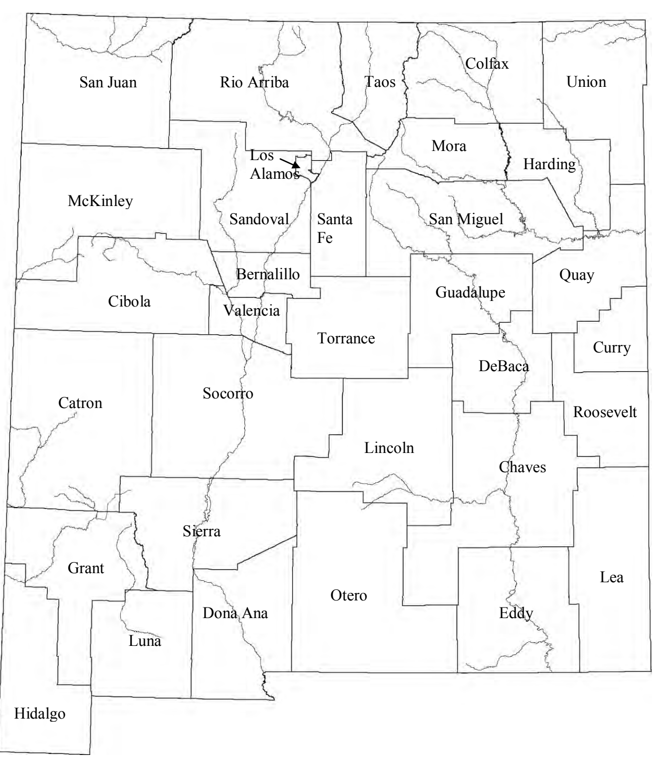
NEW MEXICO COUNTIES