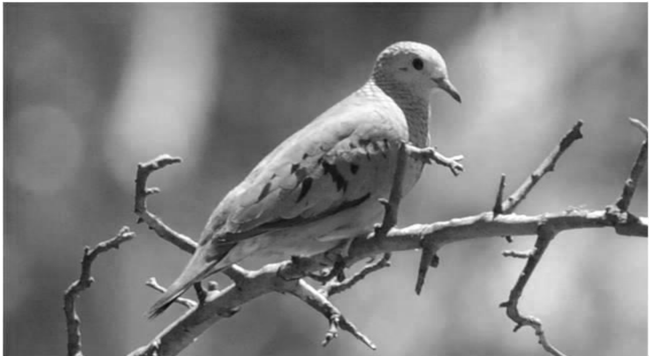
Common Ground-Dove in Guadalupe Canyon 13 June 2010, where up to four were found in June and July.

Common Ground-Dove —A strong season found up to 4 singing in Guadalupe Canyon 13 Jun (WFWe, NEH**) & 3 Jul (JEP, NDP, CLB), one at a ranch ne. of Rodeo 1 Jul (JEP, CLB) & 3 singing there 18 Jul (REW), and singles in the middle Animas Valley 2 Jul (JEP, CLB), Deming 18 Jun (R. Hodson), and Rattlesnake Springs 25 Jul (SW).