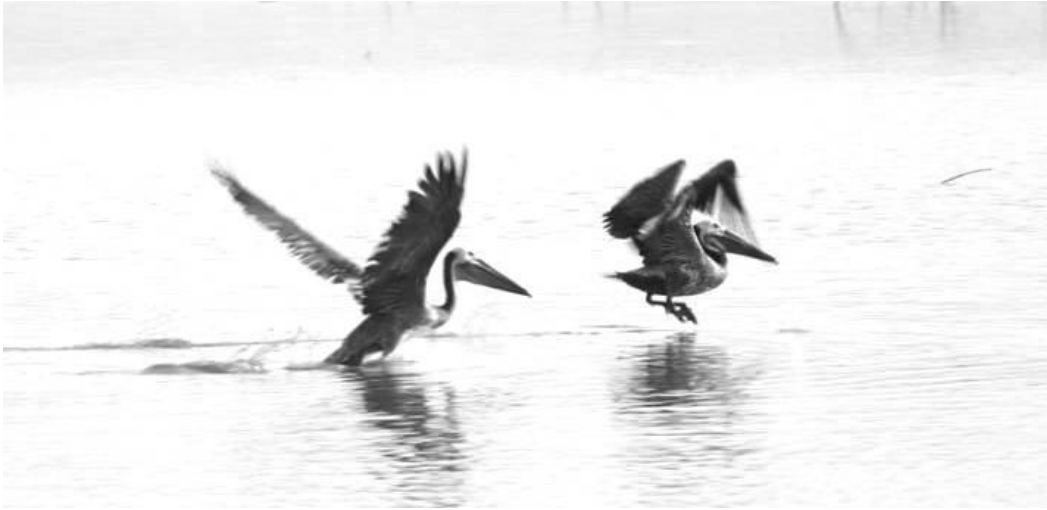
Two Brown Pelicans at Elephant Butte Lake 15 July 2010, where up to three were present in June and July.

Colonial Waterbirds —Surveys to locate nesting colonial waterbirds in the RGV from Albuquerque s. to Truth or Consequences documented colonies in four areas in Bernalillo , Valencia , Socorro , and Sierra . A colony in Albuquerque’s South Valley 12 Jun contained at least six Snowy Egret nests, seven Cattle Egret nests, and three Black-crowned Night-Heron nests (JLi, L. F. Neely). One at Bosque Farms 10 Jun held 17 Snowy nests and 33 Cattle Egret nests plus 17 Black-crowned Night-Heron nests (JLi). Three sub-colonies in the Cuates Marsh area s. of San Marcial 20 Jun together contained two Double-crested Cormorant nests and eight nests of unidentified cormorants , 14 nests of Great Blue Heron , 36 of Great Egret , 56 of Snowy Egret , and 20 of Black-crowned Night-Heron (RKM). A colony at EBL’s Indian Springs contained 93 nests 20 Jun, five of Double-crested Cormorant , 15 of Great Egret , 40 of Snowy Egret , and 10 of Black-crowned Night-Heron (RKM).