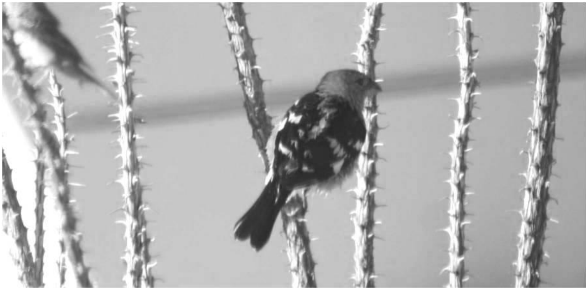
Male Yellow Grosbeak near Rodeo 5 June 2010; fifth report for New Mexico, and the first away from the vicinity of the Rio Grande Valley.

Painted Bunting —Noteworthy n. to Chaves , 4 ♂♂ were in the Cocklebur L. area n. of BLNWR 2 Jun (WHH).