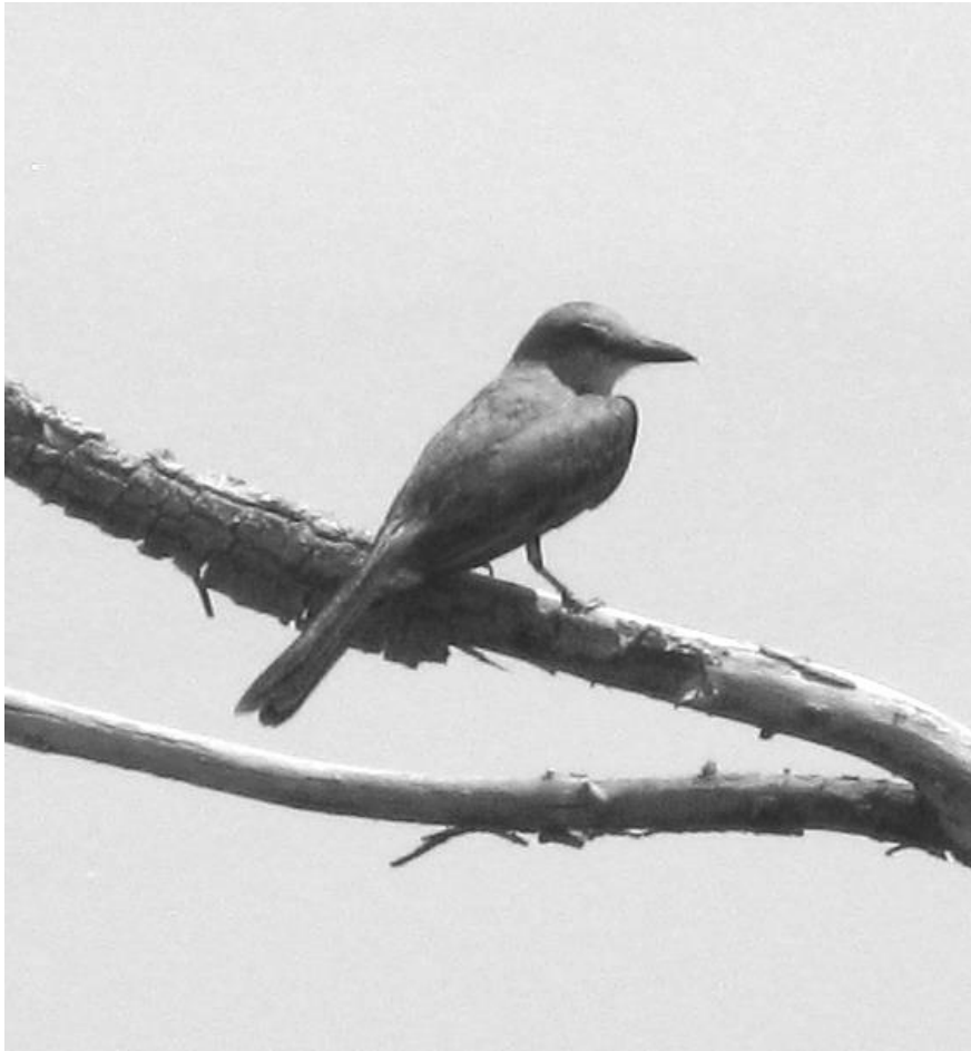
Tropical Kingbird at the Santa Teresa Country Club 15 July 2010; it was one of a pair present there that together provided New Mexico's first verified record.