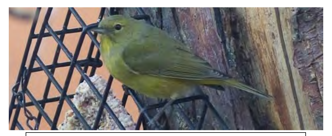
Orange-crowned Warbler at Old Town, Albuquerque, 19 January 2014.