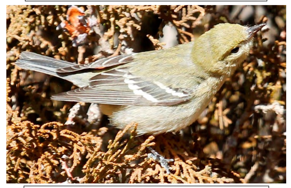
Bay-breasted Warbler at Deming 27 December 2013.