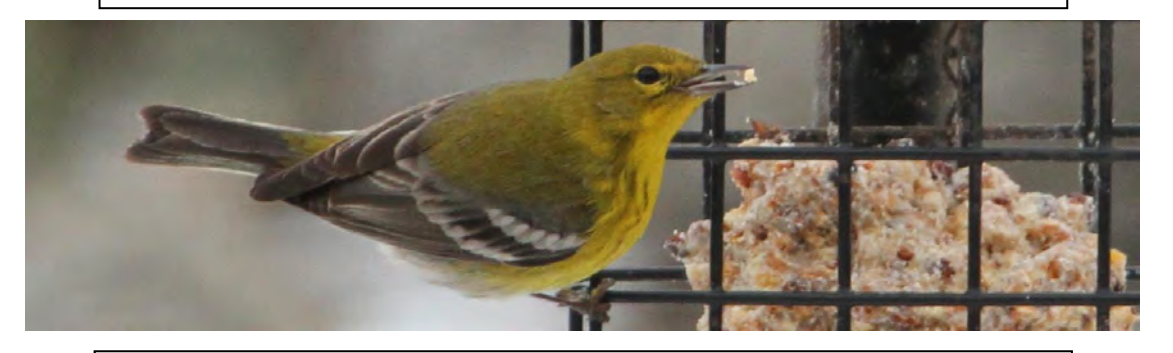
Pine Warbler in Northeast Heights, Albuquerque, 8 February 2014.