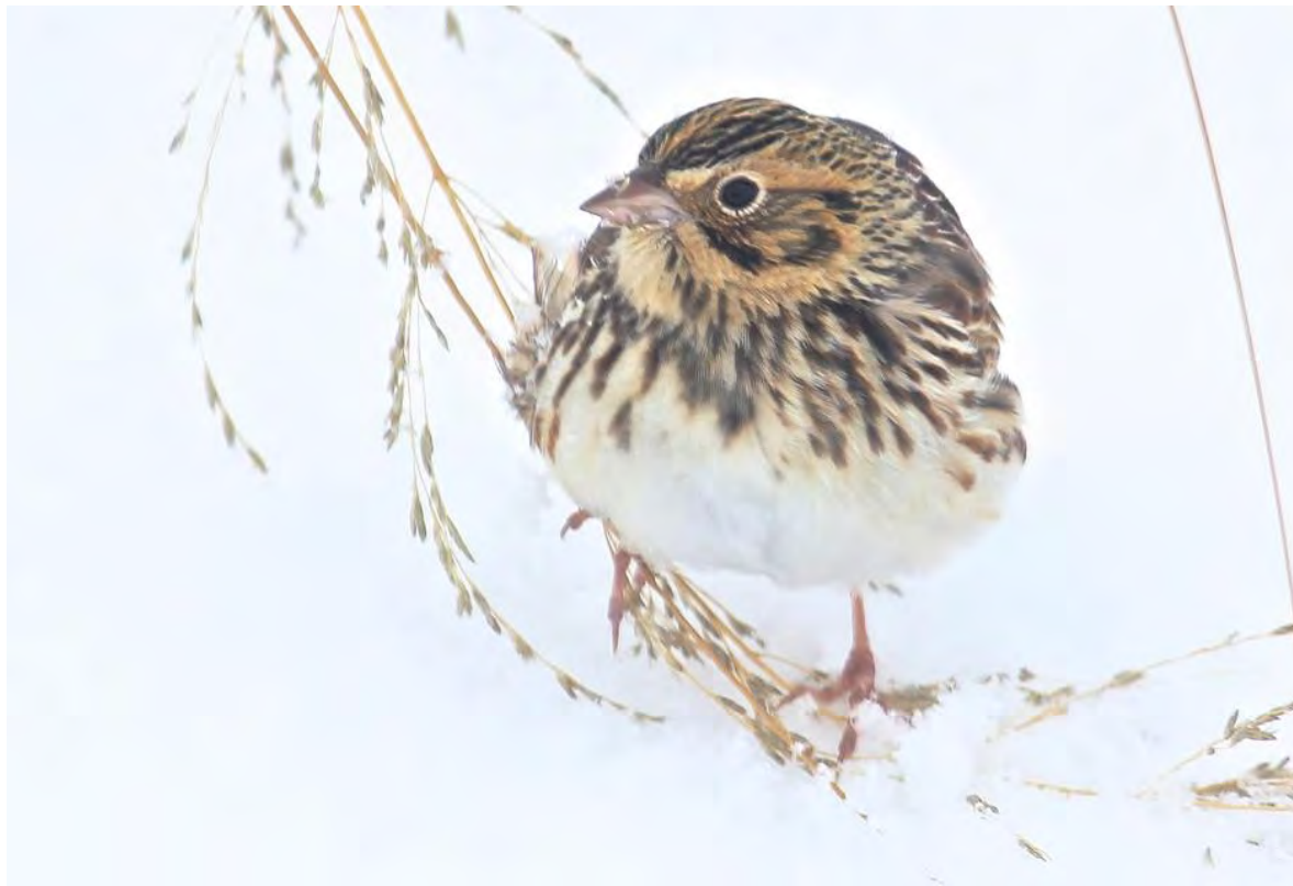
One of 16 Baird's Sparrows in the snow in the southern Animas Valley near Cloverdale on 31 December 2012.

Baird's Sparrow —Two were in a grassy swale in the Uvas Valley south of Nutt 15 Dec & 23 Feb (JEP*). In the southern Animas Valley, snow forced up to 16 to the roadside 31 Dec (MJB**, NDP**, CJW**).