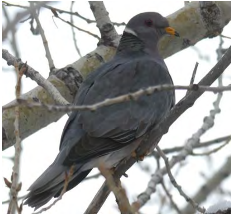
Band-tailed Pigeon in the snow at Santa Fe on 22 February 2013.

Band-tailed Pigeon —Unexpected in winter, 2 were at Doc Long PA, Sandia Mts. 6 Jan (DJK) and one was at Santa Fe's Randall Davey Audubon Center 22 Feb (JPB**).