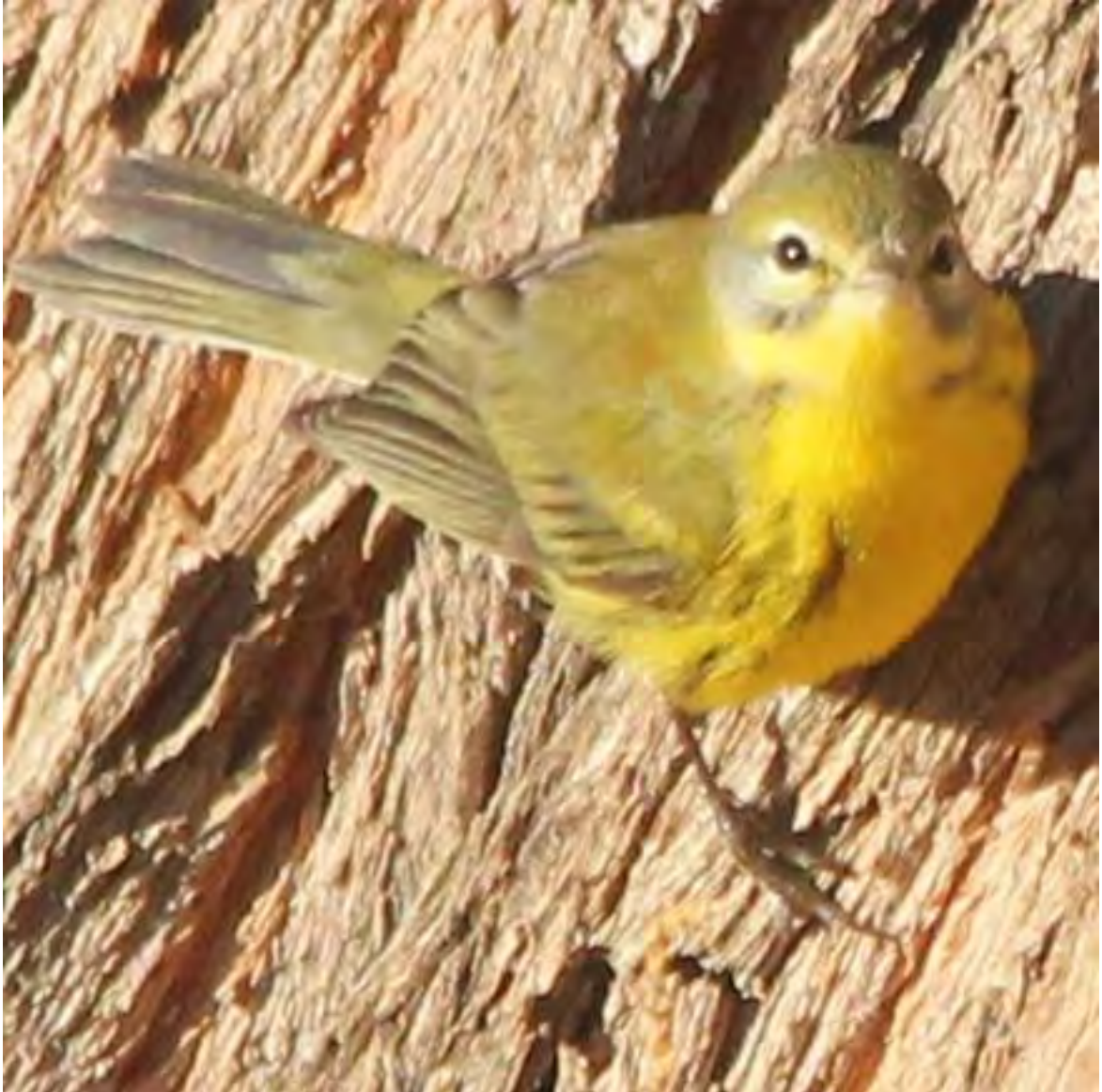
Prairie Warbler below Caballo Dam 20 December 2012.

Prairie Warbler —One at Riverside CG below Caballo Dam 18-21 Dec (TBG**, CLA**, CGL**, DJC**, JEP*, WFWi*) provided New Mexico's first Dec record.