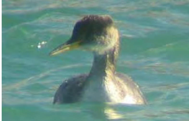
Red-necked Grebe at Lake Carlsbad on 31 December 2012, first verified Eddy County record.