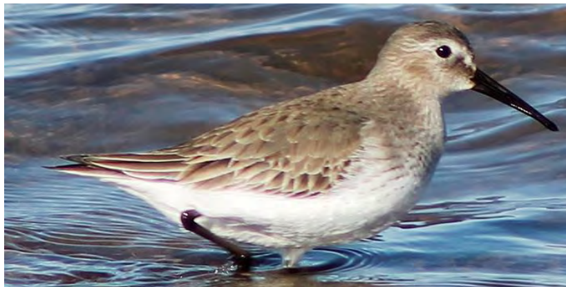
One of three Dunlins lingering at Ute Lake 20 December 2012.

Dunlin —Late for so far north, 3 were at Ute L. 20 Dec (MJB**, CJW**). Two wintered at Bosque NWR 15 Dec-10 Feb (DLH, JEP, NEH**, CGL**) and a third was there 18 Dec (CGL**). Up to 3 were at EBL (DJC, DJK) and at Caballo L. (DJC**) Dec-Jan.