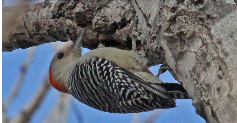
Female Red-bellied Woodpecker at Washington Ranch near Rattlesnake Springs on 14 February 2013.

Red-bellied Woodpecker —A ♀ in the Rattlesnake Springs area from 6 Dec into Mar (SW, m.ob., RN**, CLA**, JRO**, MJB**, CJW**) was the first to be confirmed there in over two decades.