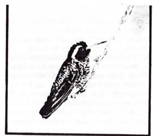
Adult male White-eared Hummingbird, Grant County, NM, 6 Aug 1993.