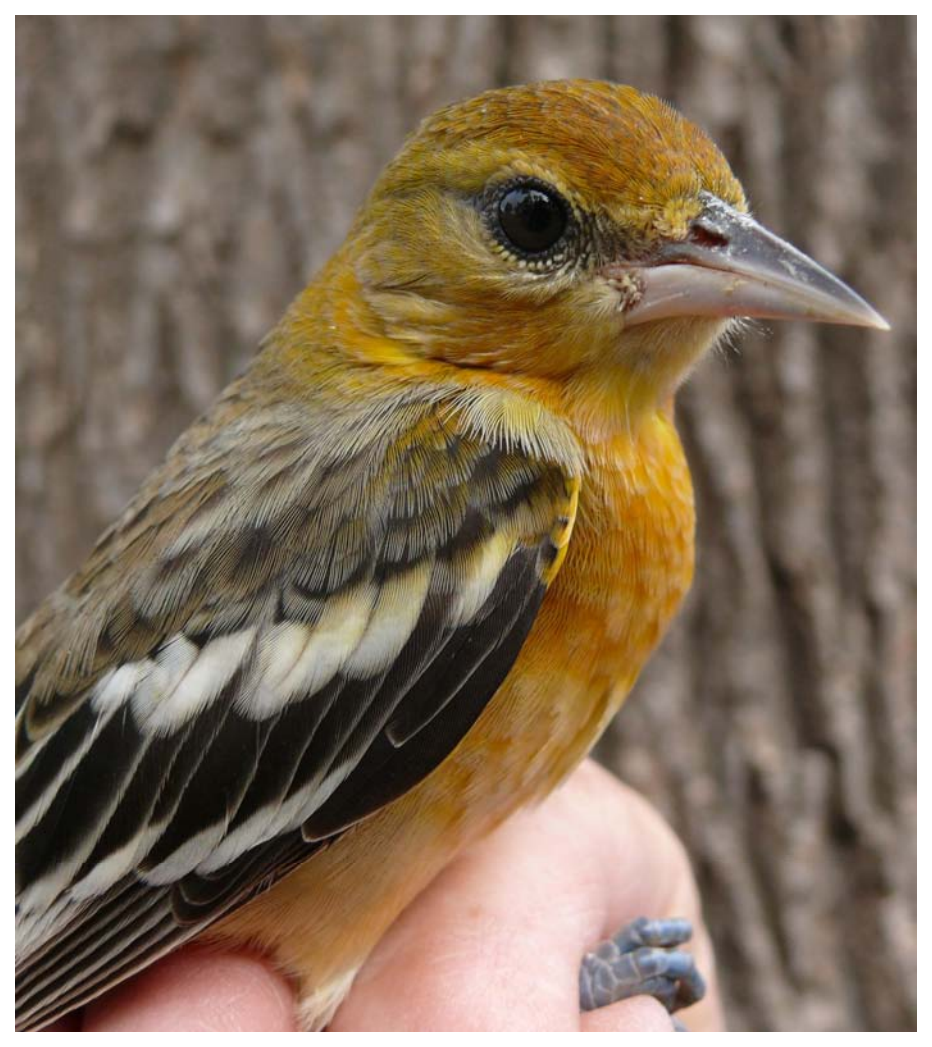
FIGURE 1. The lack of any superciliary stripe is a strong indication that this is a Baltimore Oriole rather than a Bullock's Oriole. On the median coverts, the relatively small amount of black protruding into the white tips is further evidence of this being a Baltimore Oriole. The median-covert pattern in this bird gives the white wing bar a relatively smooth-edged appearance from a distance.