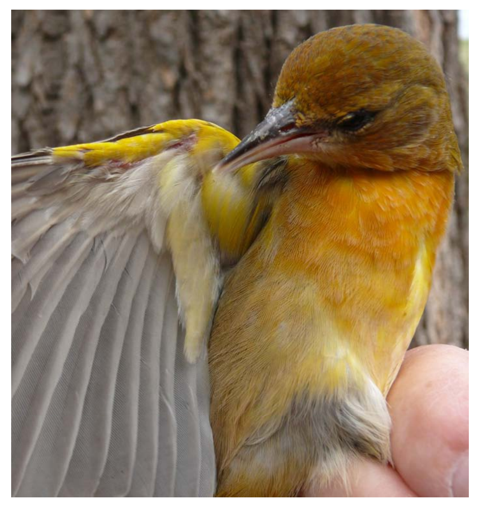
FIGURE 2. The relatively extensive orange-yellow color to the breast supports identifying this bird as a female first-basic Baltimore Oriole rather than a juvenile Bullock's Oriole. The pale yellow throughout the belly and flanks with little or no orange supports this identification.

Wings.—Lee and Birch (1998, 2001) document the median covert patterns of both oriole species. In Bullock's Orioles the black intrudes substantially into the white feather tips and creates a serrated appearance. In Baltimore Orioles there is relatively little intrusion of