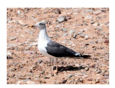
(L) Juvenile Sabine's Gull, Elephant Butte Lake, (R) Lesser Black-backed Gull, Elephant Butte Lake.