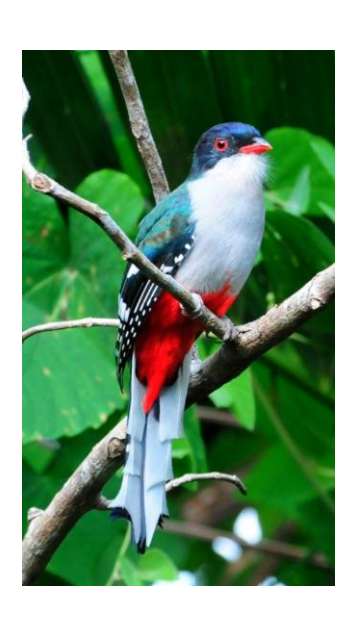
(L) Cuban Tody, (R) Cuban Trogon