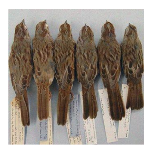
Figure 1. Three topotypes of Melospiza melodia bendirei [=fallax] January 1957 and November 1959 (right) and recent specimens of similar populations (left), showing the degree of reddening (foxing) that has occurred in a relatively short period.

Four topotypes of bendieri from the Salt River in Phoenix, Maricopa Co. were received in the Amadeo M. Rea collection; 7 January 1967 (MSB 16285); 27 November 1969 (MSB16299); 12 April 1971 (MSB 16391); and 12 April 1971 (MSB16291). Unfortunately, these proved to be so foxed in the reddish tones, that they are as distinct from our 1997-1998 specimens as any two widely recognized Song Sparrow subspecies (Fig. 1), and were useless for color comparison. This occurred in just over 20 years.